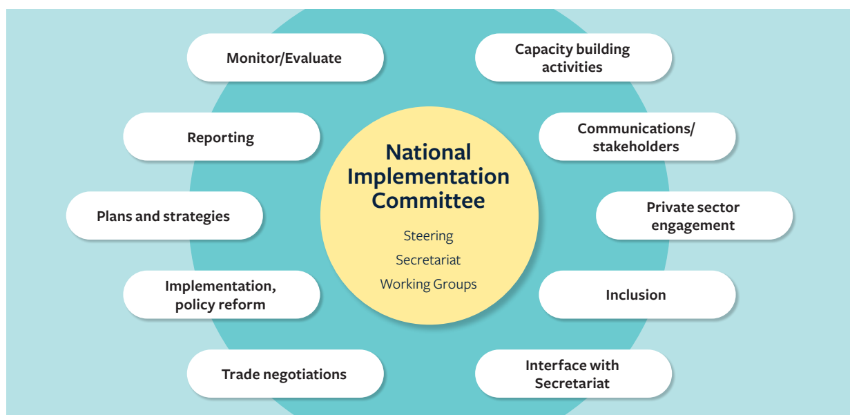
Figure 1 Ten essential functions of NICs